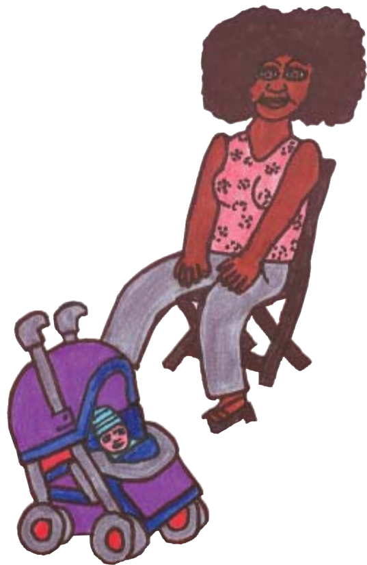
Illustration by Kellie Craig