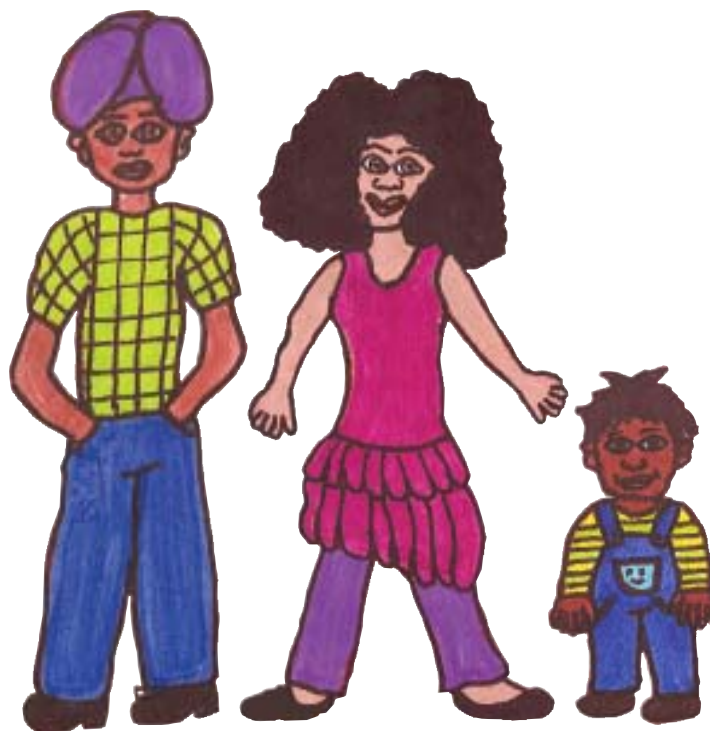
Illustration by Kellie Craig